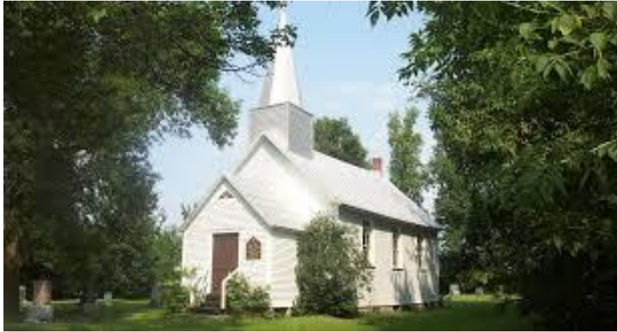
Grace Church, L'Acadie